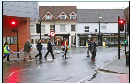
Going past Vue cinema and making its way across the road towards the Bus Station