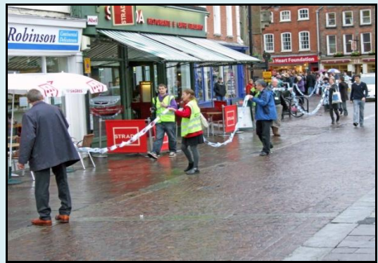
The paper chain starts to stretch its way towards the Kennet Centre.