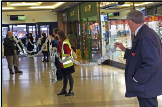
Making its way through the shopping centre and round to the Vue Cinema