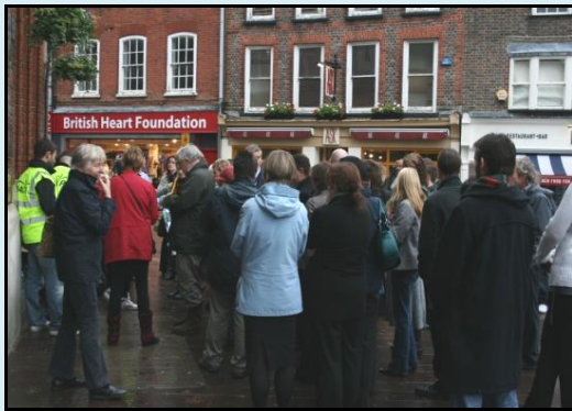
Volunteers met outside the Town Hall at 2pm on Takeover Day.