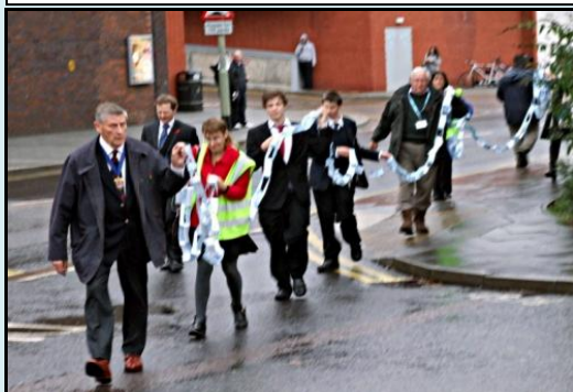
The rain starts to get heavy as we pass the Bus Station